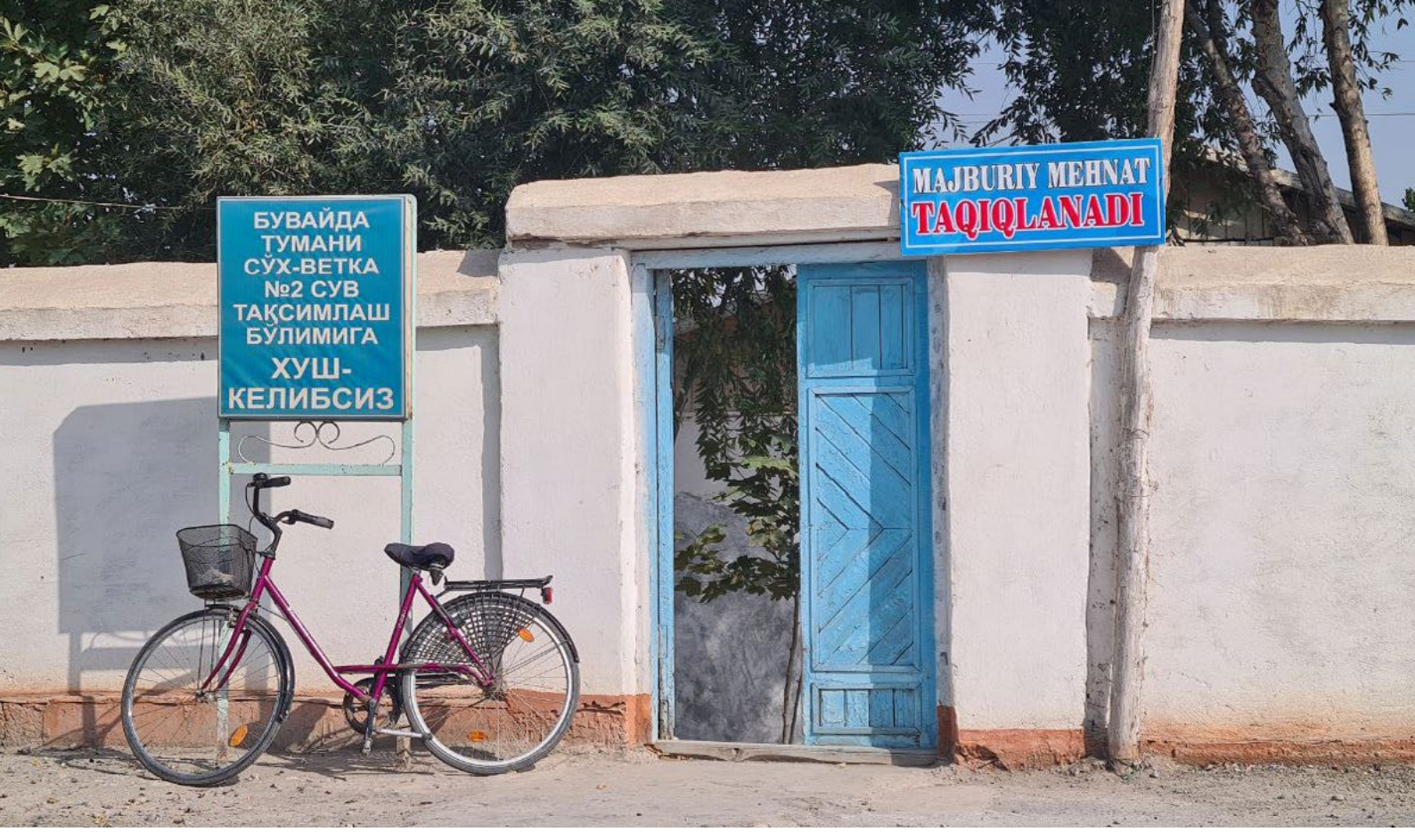
September 2022, Buvayda district, Ferghana region. Poster at the entrance of the district water distribution organization: "Forced labor is prohibited".

The protocol reveals that comprehensive control over the cotton harvest is strictly centralized. For this purpose, "the Republican Information Center" (and its district and regional departments) was established "to coordinate, record, and analyze the ongoing work on the organization of the 2022 cotton harvest, as well as to promptly solve any problems that may arise."