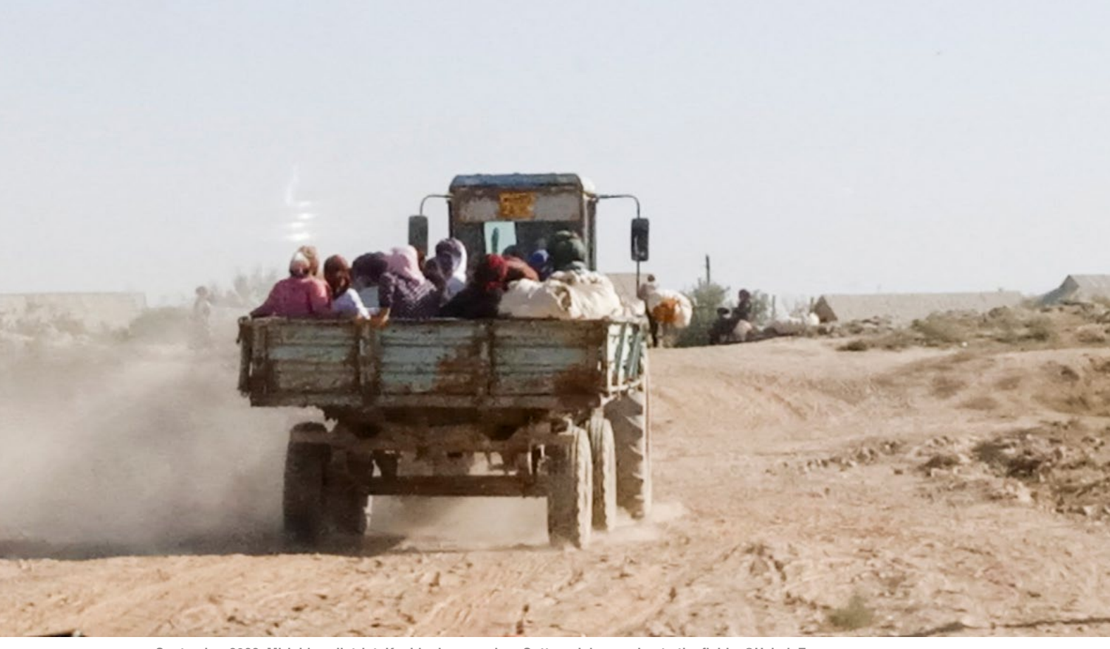
September 2022, Mirishkor district, Kashkadarya region. Cotton pickers going to the fields.