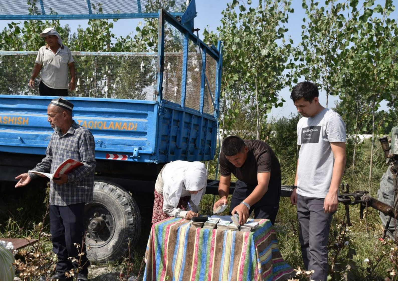
Cotton pickers collecting their wages, Ferghana region, September 2022.