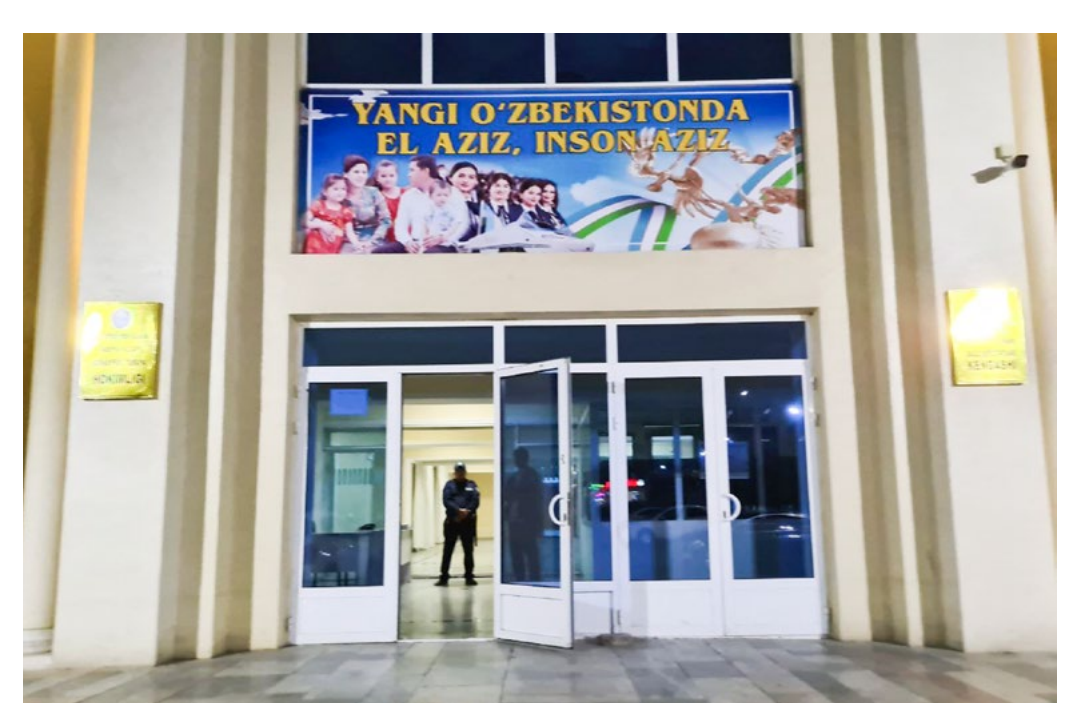
October 2022, Uchkuprik district hokimiyat where farmers were forced to "voluntarily" give up their land. Poster: "The new Uzbekistan values the nation and its people".

Uzbek media has covered dozens of cases of illegal land confiscations, sometimes with positive outcomes after prompting interventions by the authorities.