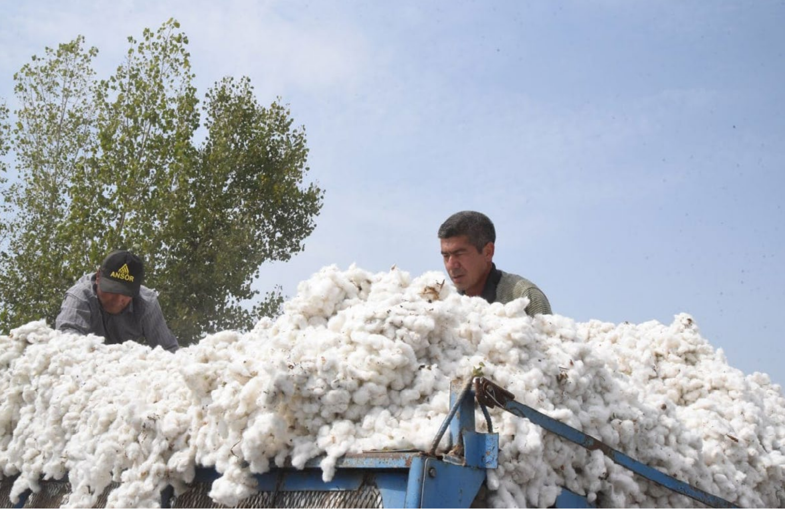
Cotton worker, Ferghana, 2022.

The absence of independent representative farmers' organizations leaves farmers particularly exposed to abusive practices. The Farmers' Council, although somewhat responsive to farmers' concerns in 2022, does not have the influence to effect changes to policy. This is best illustrated by the proposed recommended price for cotton in 2022 which cotton clusters were then able to ignore following appeals by the clusters to government officials. Given the unequal balance of power between farmers and cotton clusters, an independent farmers' association is urgently needed to protect the rights of farmers from illegal land confiscations and exploitative contracts.